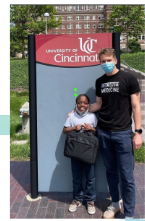
CYC UC Med Mentor Mentee & Mentor