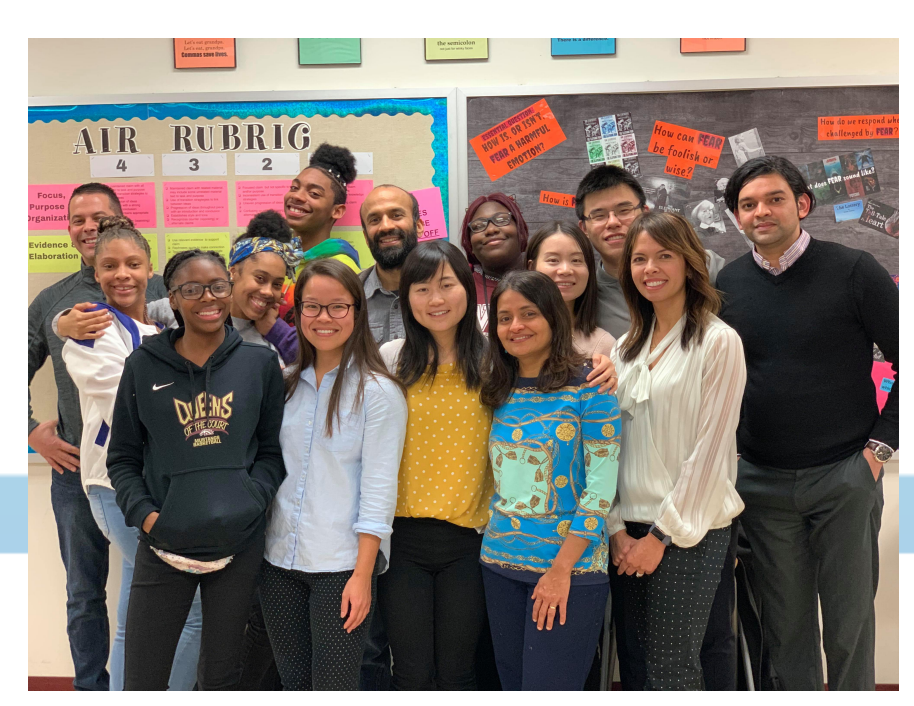
CYC Corporate Mentoring