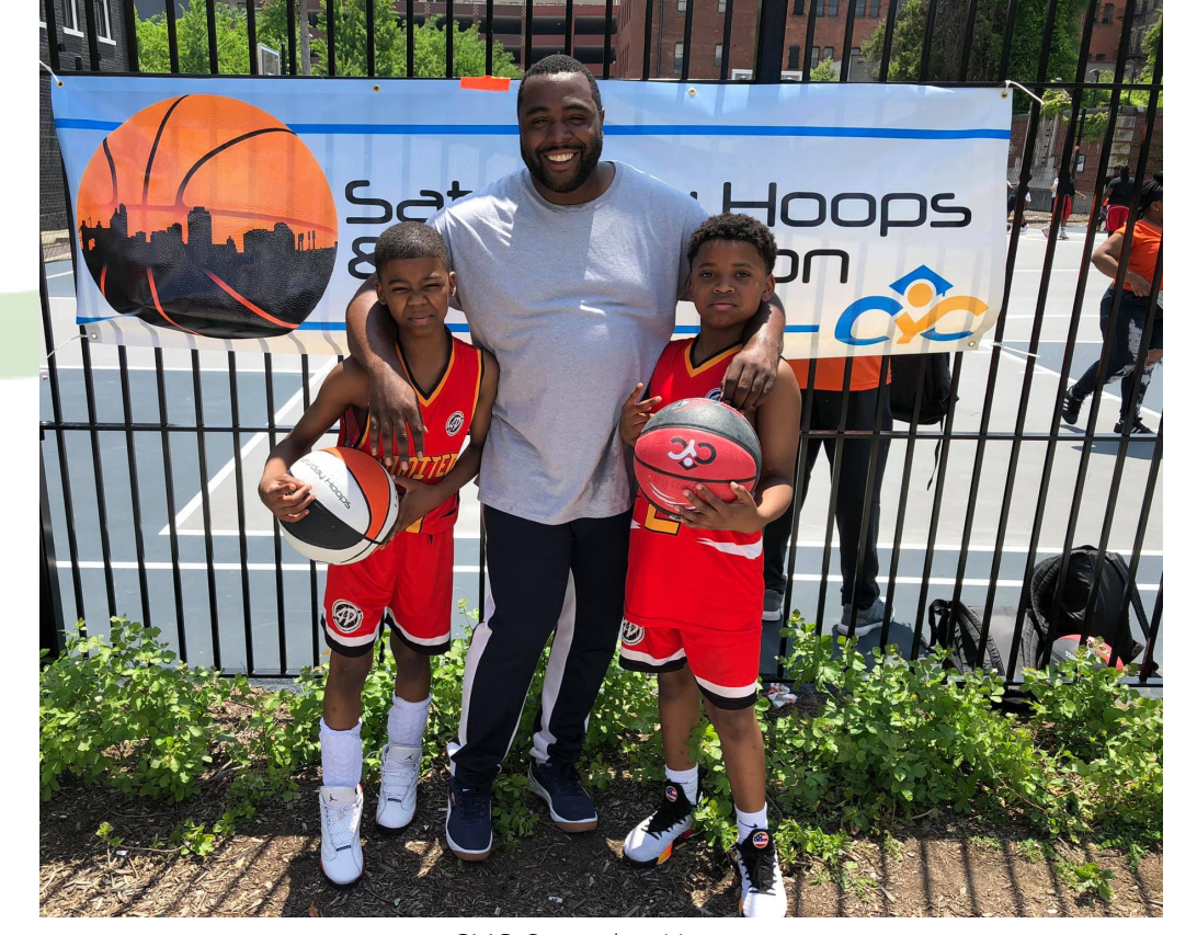
CYC Saturday Hoops